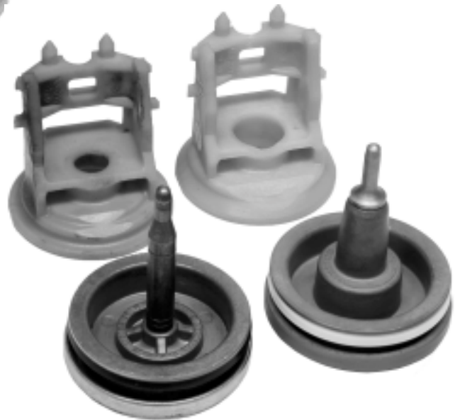
Early Style Servo and Guide

If you upgrade to the self-adjusting servo you must also use the later-model servo guide. The part number for the later-style guide is 140 277 08 40.